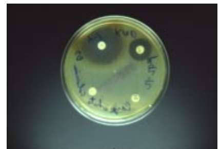
Figure 1. A sensitivity test shows the resistance of the disease-causing bacteria to various antibiotics.

To optimize the response to antibiotics provided in feed, producers should correct other problems which may have predisposed fish to the bacterial infection. This should include checking water quality parameters and submitting proper fish and water samples to a diagnostic laboratory. If the fish have a bacterial disease and the causative agent has been identified, a sensitivity test should be performed to ensure that the correct medication is used. A sensitivity test (Figure 1) shows the resistance of the disease-causing bacteria to various antibiotics. If bacteria are unable to grow in the presence of a particular antibiotic, a zone of inhibition or clear area is present surrounding the area treated with that drug. If the drug has no effect on the bacteria, they will grow up to or over the top of the disc.