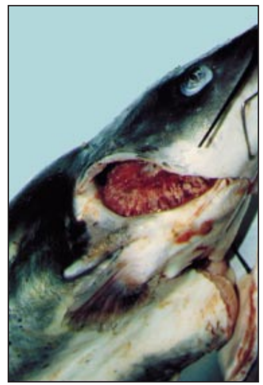
Figure 1. PGD causes swelling and red and white mottling of catfish gills, giving them a raw hamburger appearance.

Proliferative gill disease occurs most often in the spring, but it can occur in the fall at water temperatures between 59 and 72° F (15 to 22° C). It sometimes occurs in winter; PGD mortalities have been reported at 43° F (6° C). Though the disease seldom occurs in the summer, deaths have been reported at 92° F (33° C). Even before